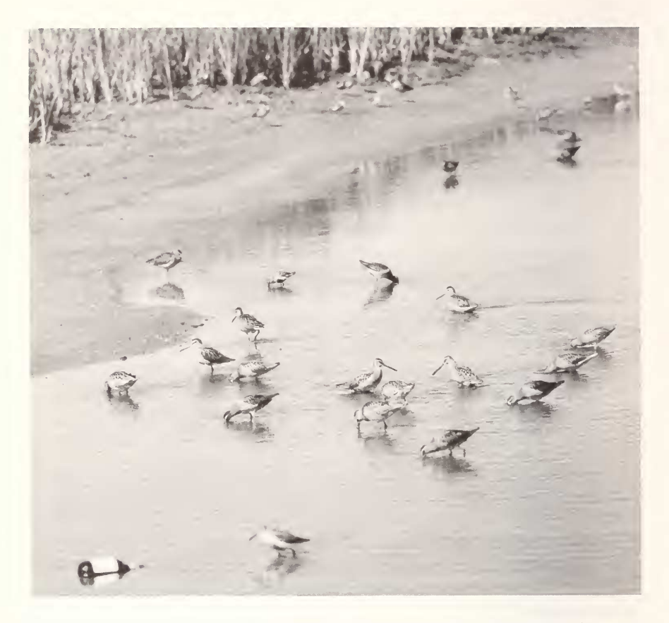
Fig. 15. Long-billed dowitchers feeding at Goodnews Spit, 23 July 1974.

to nest at Crooked Island (P. D. Arneson and D. B. McDonald, personal communication).